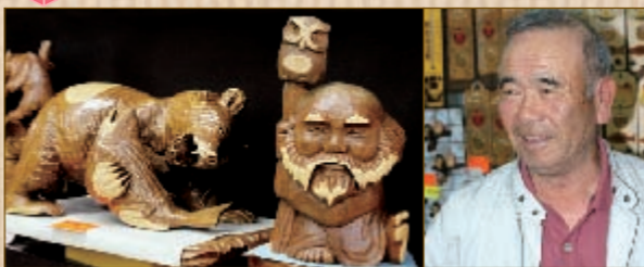
小野民芸店 : Ono Migeiten AM7:00 ~ PM10:00 ☎ 67-2373 不定期休

The popular products of this store are the Fukuro (owl), which is regarded as a good luck talisman and wood carvings of other animals. The products get better with time and there are many to choose from.