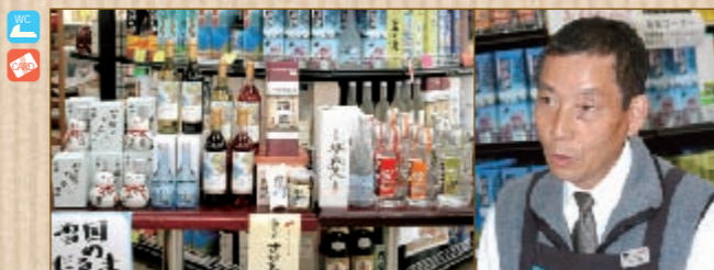
カナヤマ本店 : Kanayama Honten AM9:00 ~ PM8:00 ☎ 67-2274 不定期休

This store contains a local liquor section which sells Hokkaido's sake, shochu (vodka) and wine. This store also sells a variety of famous local snacks.