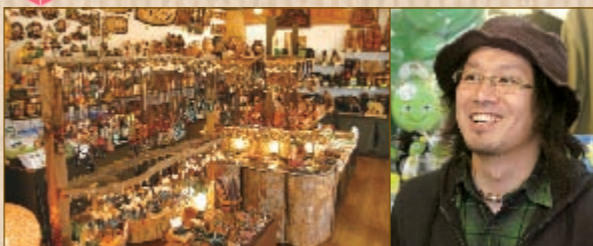
かと里(湖水店) : Katori Kosuiten AM8:00 ~ PM7:00 ☎ 67-3239 冬期不定休

This shop has a variety of attractive accessories decorated with Ainu designs. Items include straps and pendants.