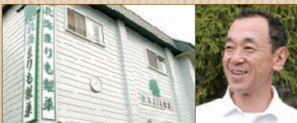
北海まりも製菓 : Hokkaimarimoseika AM9:00 ~ PM5:00 ☎ 67-2927 不定期休

This company specializes in sweets! When it comes to the sweets of Lake Akan, Marimoyokkan (sweetened and jellied been paste) and Akan Shimpui (jelly) are highlights. You can buy a set of these two products together